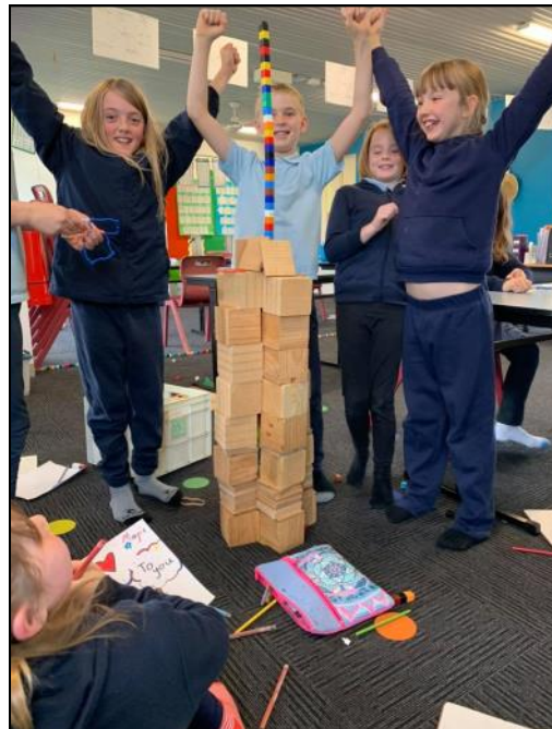
Team tower building