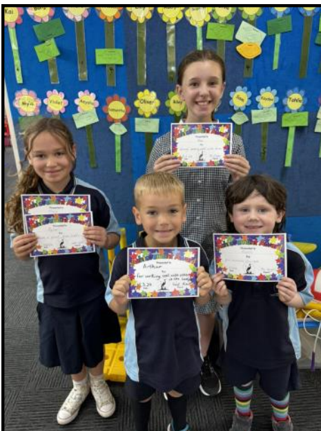
Congratulations to these students for demonstrating good team work.