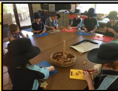
Preparing, cooking and eating the potatoes.